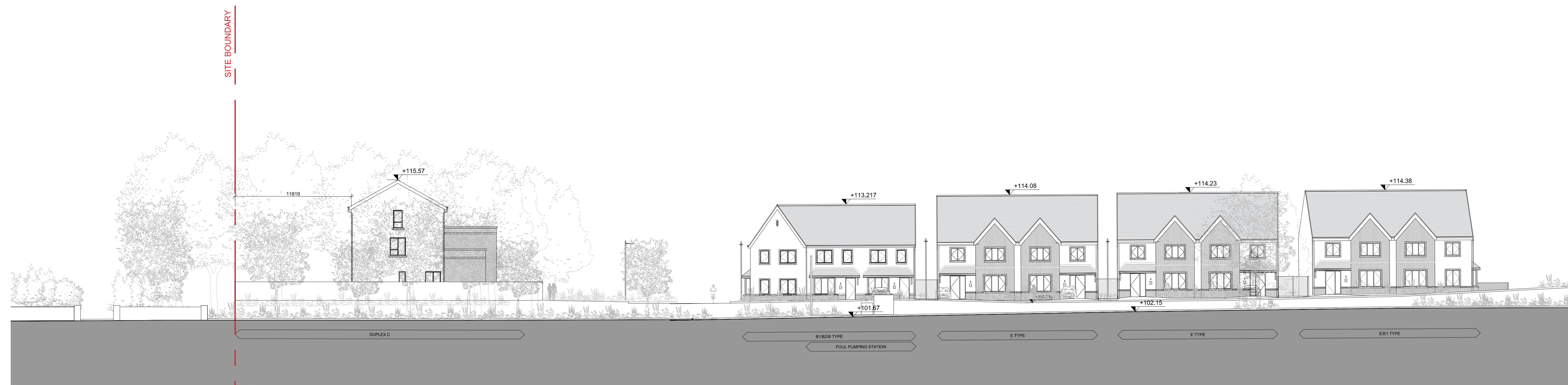
3 PROPOSED CONTIGUOUS ELEVATION 1-1 (PART A) SCALE: 1:200