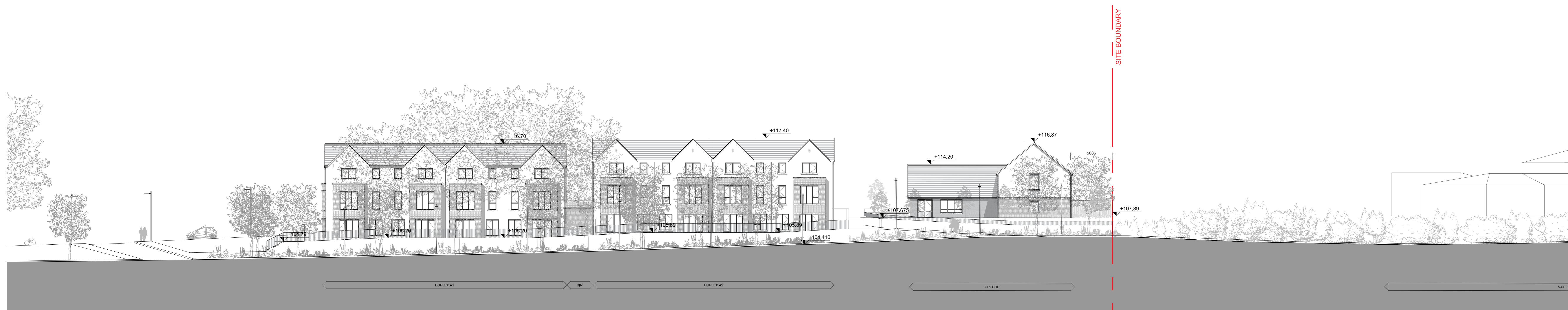
4 PROPOSED CONTIGUOUS ELEVATION 1-1 (PART B) SCALE: 1:200